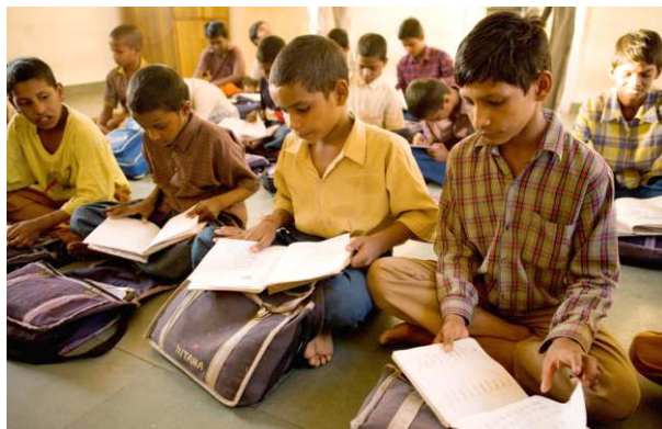
Children doing their homework at the drop-in-center

Recognizing the importance of family, PCI seeks to reunite with family members those children who may have run away from home, been trafficked, or accidentally separated from their parents. This is an extensive and difficult process involving family tracing and assessment, counseling of the family and of the