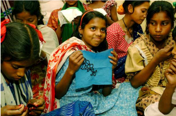
A sewing student at PCI's Vocational Training Center proudly shows her handiwork