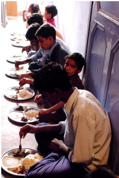
Children having their lunch at shelter home

In order to sustain a life off the streets, these children must acquire marketable skills that eventually enable them to get jobs. PCI offers vocational training in dress making/tailoring, cosmetology, art and traditional henna painting, and computer skills. PCI seeks to not only train young people in employable skills, but to help place them with employers as well. PCI assists the older youth in securing apprenticeships and sometimes brings potential employers to the vocational training center to interview students for potential jobs.